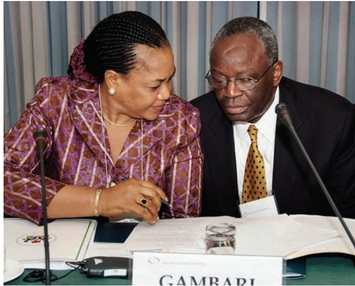
Professor Joy Ogwu (left) (Minister of Foreign Affairs, Nigeria) and Professor Ibrahim Gambari (Under-Secretary-General and Special Adviser to the United Nations Secretary-General)