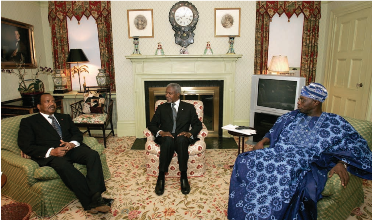
President Paul Biya of Cameroon (left) with Secretary-General Kofi Annan (center) and President Olusegun Obasanjo of Nigeria (right) at Greentree, Long Island, New York, June 12, 2006.

of the United Nations. The purpose of this meeting was to relaunch the proceedings of the Cameroon-Nigeria Mixed Commission. At this meeting, the two heads of state and the Secretary-General requested the Mixed Commission draw up a new withdrawal program to be submitted for approval.