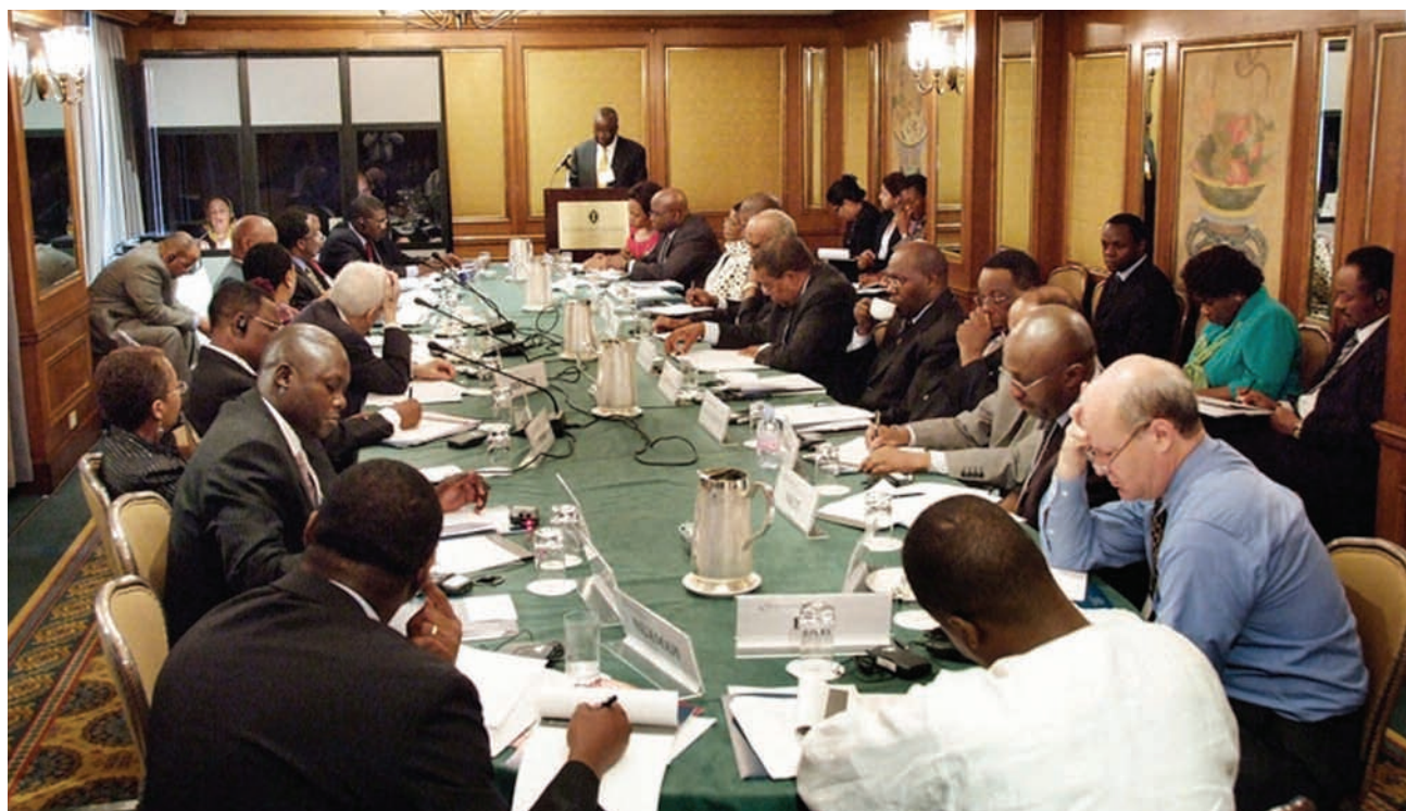
Participants at the Conference, "Lessons from the Resolution of the Bakassi Dispute," July 18, 2007, InterContinental Hotel, New York City.

In the months leading up to the final handover of Bakassi and the conclusion of the political transition in Nigeria, there were moments when the implementation of the Greentree Agreement seemed in doubt, most dramatically, on November 12, 2007, when twenty-one Cameroonian soldiers were killed in a raid. Yet Nigerian President Umaru Yar'Adua appeared before the Nigerian Senate on December 12, 2007, to confirm his personal commitment to the ICJ ruling and the Greentree Agreement, and by overturning the Senate's efforts earlier in November to block the implementation, reinforced the strong prospects for the final handover of the Bakassi territory to Cameroon, which was indeed completed in a ceremony on August 14, 2008.