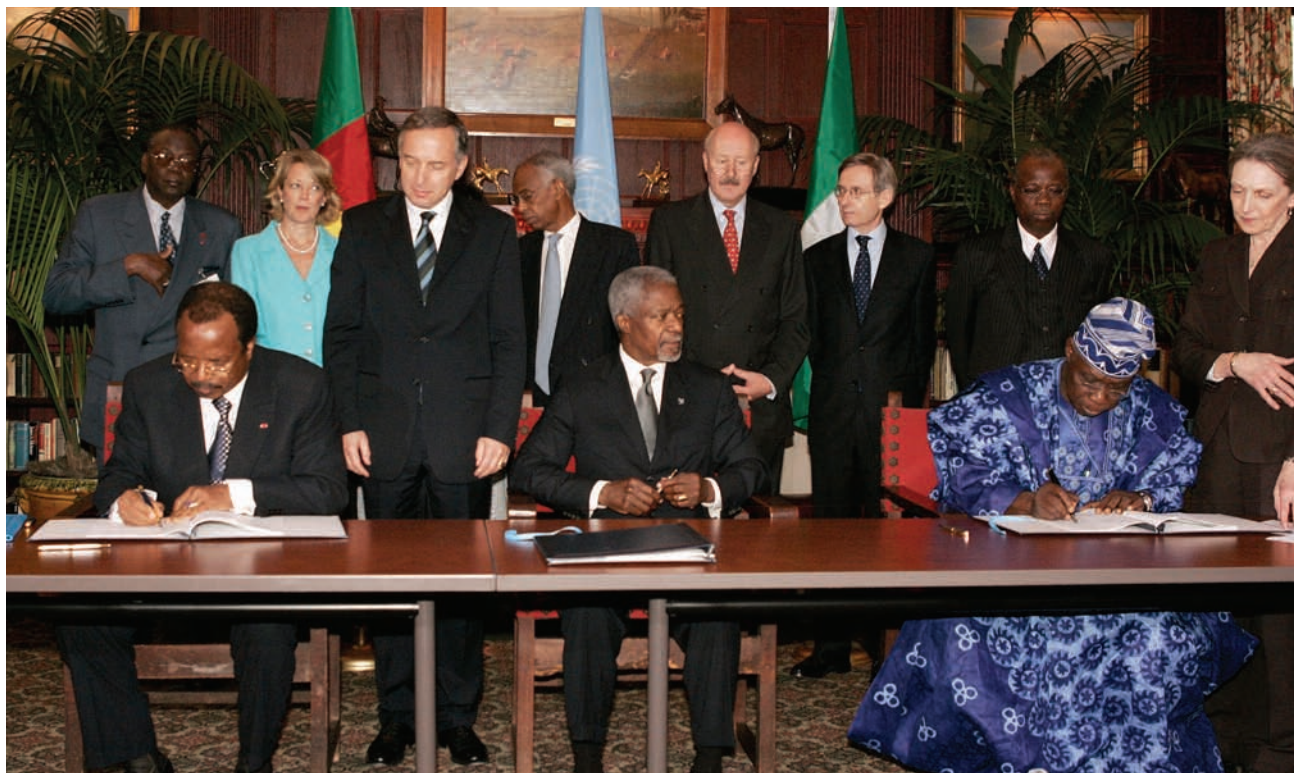
President Paul Biya of Cameroon (left) and President Olusegun Obasanjo of Nigeria (right), along with United Nations Secretary-General Kofi Annan (center) sign an agreement regarding the dispute over the Bakassi Peninsula, at Greentree, Long Island, New York, June 12, 2006.