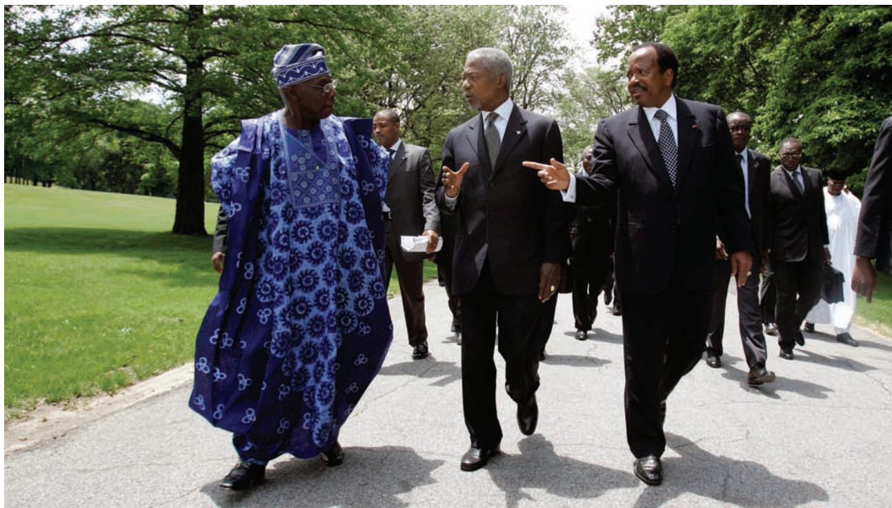
Secretary-General Kofi Annan (center) walks with Presidents Olusegun Obasanjo (left) of Nigeria; and Paul Biya (right) of Cameroon, at the start of the meeting of the Cameroon-Nigeria Mixed Commission over the Bakassi Peninsula issue, at Greentree, Long Island, New York, June 12, 2006.

State implosion diminishes irredentist claims as the case of Somalia demonstrates, creating new opportunities for the emergence and reemergence of smaller states, reflecting a healthy balance between geographical and political boundaries. While not recognized in law, Somaliland and Puntland present interesting cases of this phenomenon. Yet as the border skirmishes between Somaliland and Puntland (and probably a new South Sudanese state with the old Sudan) attest, even new states need unambiguous borders. By the same token, efforts to check state disintegration are a collective and regional African enterprise, primarily because it unleashes refugees and other ills that task and threaten neighbors. Borders are a critical mark of sovereignty and responsibility, values that are obliterated when disintegration ensues.